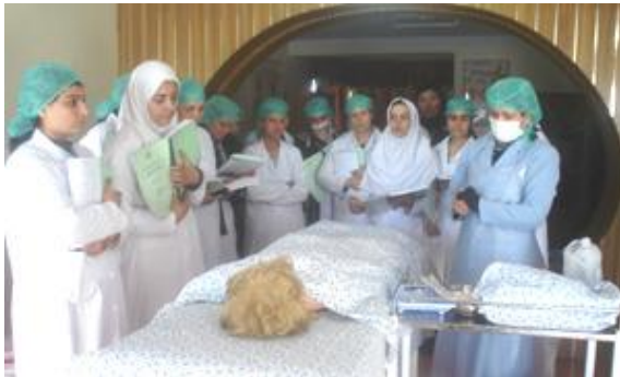
Midwifery Training in Pole Alam

Medical Refresher Courses for Afghans (MRCA) is a French NGO, entirely health oriented. Set up in Oct. 1985 in Paris, it provided Afghan refugees in Pakistan with integrated health services from 1986 to 2004. Other health services were later implemented in Afghanistan: in Chak-e Wardak from 1994 to 1997, in Kabul Maiwand Hospital since 1996, in Charikar Provincial Hospital (Parwan province) from 2002 to 2004, in Logar since Dec. 2004 and in Baghlan since Aug. 2006.