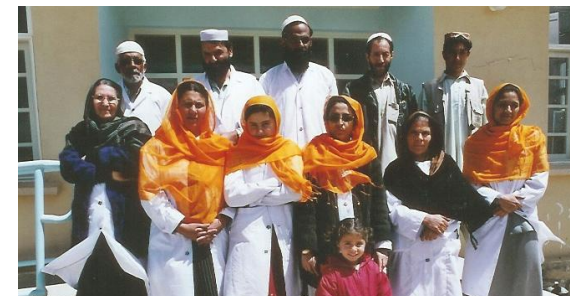
Emergency Obstetrics Center team in Mango (Kharwar)

MAIN DONORS - MRCA mainly achieves its objectives with financial support from the European Commission, the French Government, the Japanese Embassy in Afghanistan, the UNFPA, the World Health Organisation and the World Bank.